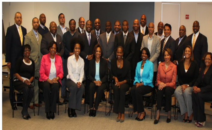
2010 and 2011 ITSMF Protégé Graduates take group photo.