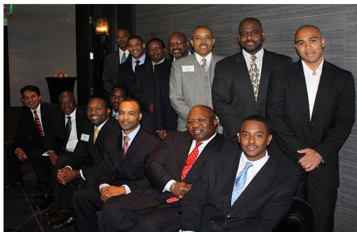
2010 and 2011 male ITSMF Protégé graduates.